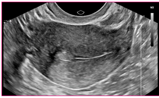
Above – before the saline infusion Below – after the saline infusion