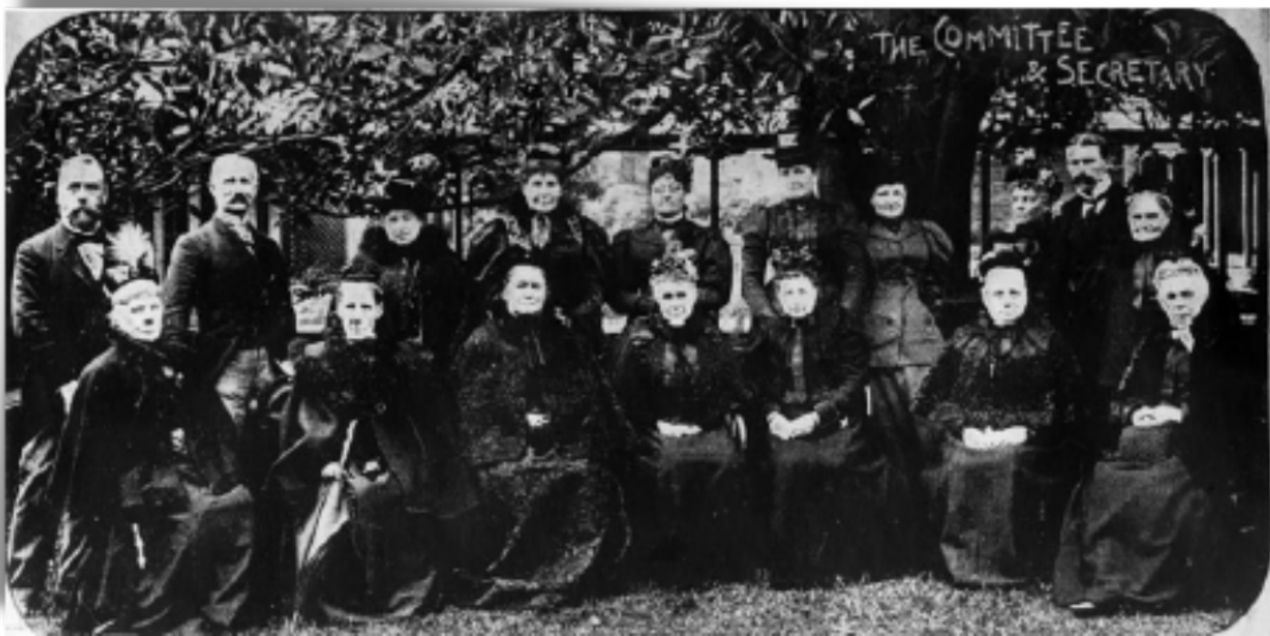
Committee of Management and Secretary