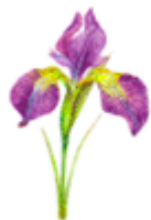
Sex & Sexuality