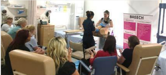
Breech workstation for clinical staff

The program supports and encourages multi-disciplinary participation. Suggested participants include midwives, registered/enrolled nurses, general practitioners, medical and midwifery students, paramedics and other clinicians as appropriate at your site.