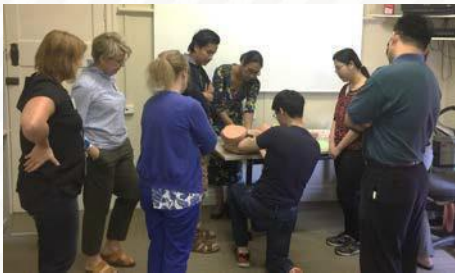
Shoulder dystocia workstation for clinical staff

Our program is designed to meet these needs and prepare your clinicians for unexpected birth.