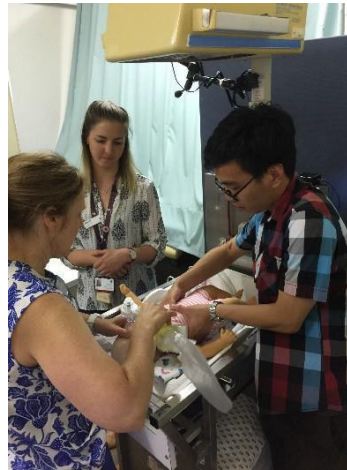
Newborn resuscitation workstation for clinical staff